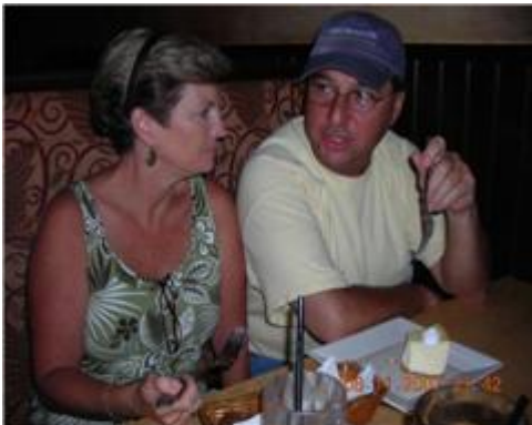
“Are you sure there are no calories in this?”