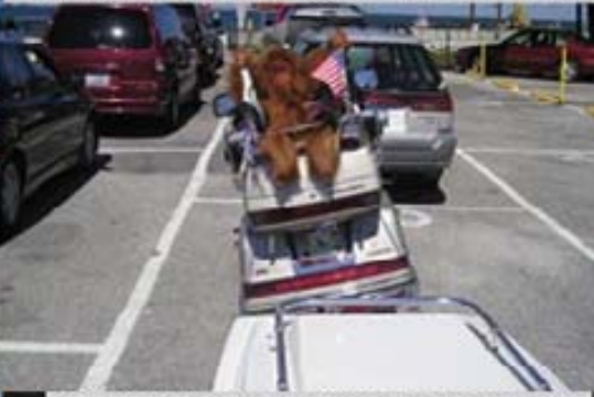
RANGIE ALSO WAITING