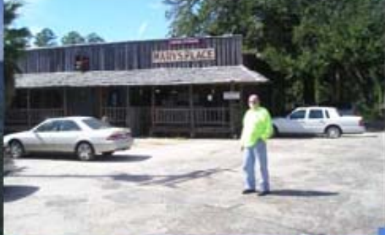
GOOD PLACE TO EAT DAUPHIN ISLAND