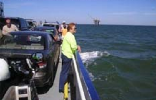
CROSSING MOBILE BAY