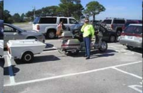
WAITING TO CROSS MOBILE BAY