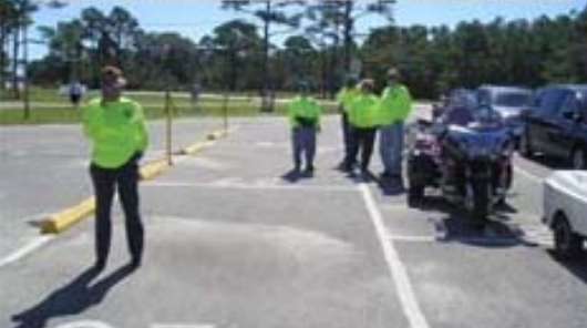
WAITING FOR FERRY