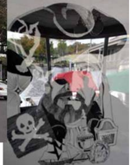
No Carl, your not going blind! You left your jacket on the windshield!