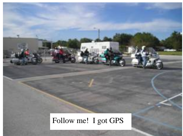
Follow me! I got GPS