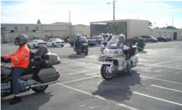
If your going to drive this slow, I am going to pass ya.