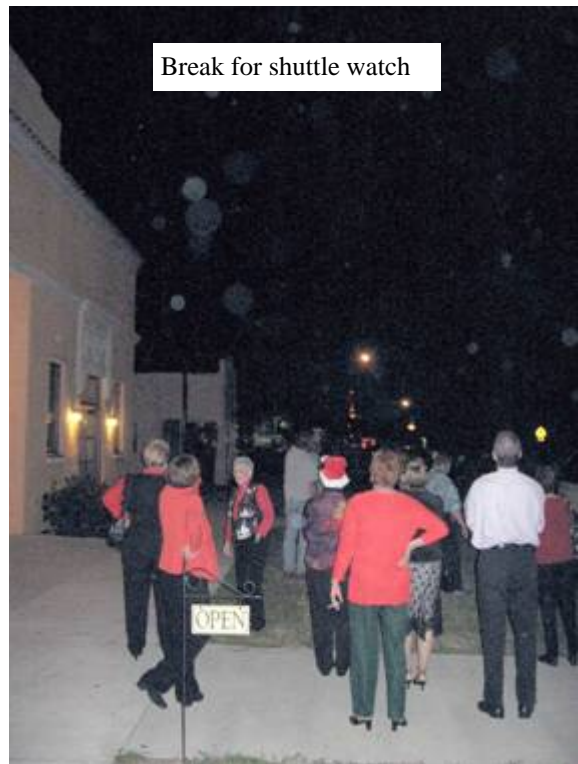
Break for shuttle watch