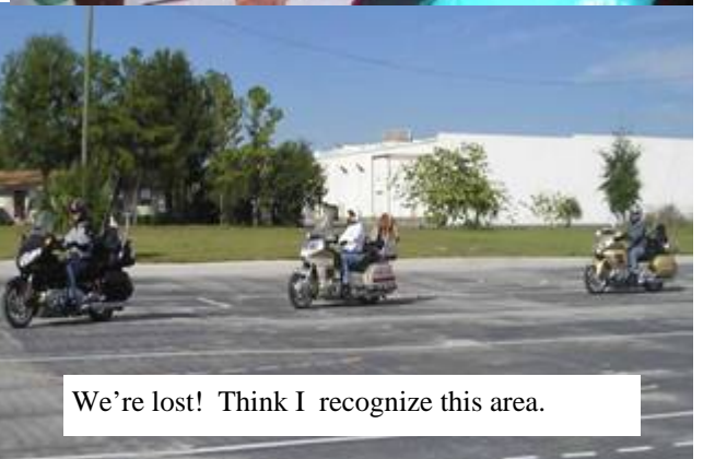
We're lost! Think I recognize this area.