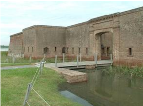
Fig 3 – Fort Jackson

Sat – Saturday morning I got up early, placed the "Do Not Disturb" sign on the door for Sharyn, had a quick waffle breakfast in the lobby, and headed out to explore some of Savannah's history. Sharyn got a few extra winks and then did her own tour of Savannah's shopping opportunities. We had agreed to meet up later for lunch. My goal for the morning was to check out the local forts and light house on nearby Tybee Island. I later learned that Savannah has 6 forts from downtown to Tybee Island 15 miles away. The first is downtown near the old train station and was the site of a Revolutionary War battle. The earthen fort is currently being restored. The second is a brick fort downtown at the foot of Bay St. The remains have been converted and reused for commercial activities for many years. The third was described to me as being the large mound behind the granite dealer on E. President St. This is on private property and unfortunately there are no current plans for its restoration.