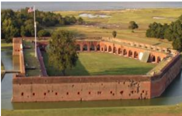
Fig 4 – Fort Pulaski

The fifth fort is Fort Pulaski (Fig 4), named after a Polish soldier who died fighting the British near Savannah during the Revolutionary War. Fort Pulaski is a National Monument and is famous for a couple of reasons. It was one of the sites for the movie Glory plus it was the brick fort that changed military tactics. Fort Pulaski looks very similar to Florida forts like Fort Jefferson (Dry Tortugas) and Fort Zachary Taylor (Key West) with the exception that the Florida forts never fired in anger. Fort Pulaski was the scene of a fierce Civil War battle where the Yankees shattered the southeast corner of the fort with a 30 hours bombardment from Tybee Island a mile away using new rifle barrel cannons. Although the corner (bottom-right) was rebuilt during the Civil War, impact holes and embedded shots are still visible.