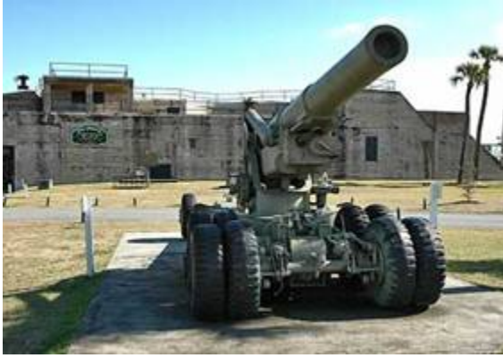
Fig 5 - Fort Screven

The sixth fort, Fort Screven (Fig 5), is a couple of miles up the road on Tybee Island. This fort was modernized during WW-II and is now made of steel re-enforced concrete. The Tybee Island Light House (Fig 6) is across the street. I had visited both of these on my previous trip so I made a slow pass and continued back to the other forts and then on to Savannah.