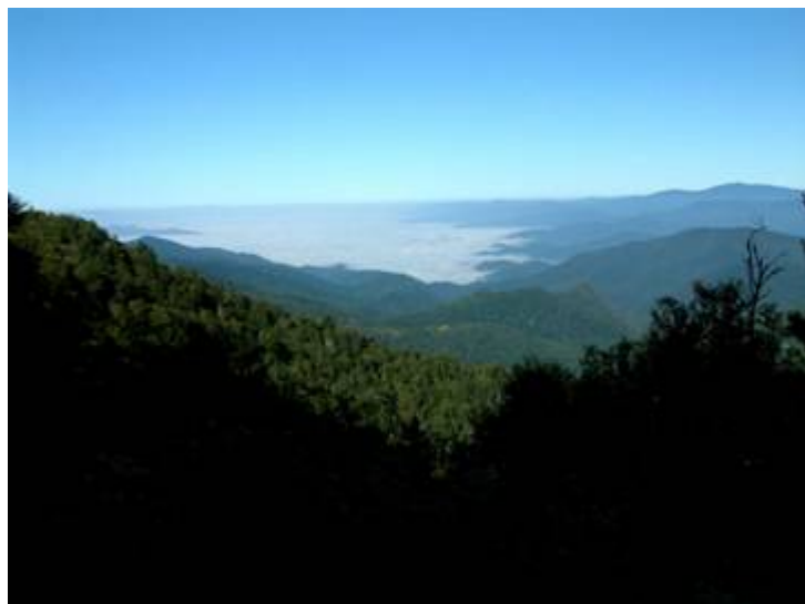
N.C. Blue Ridge.....calling.....