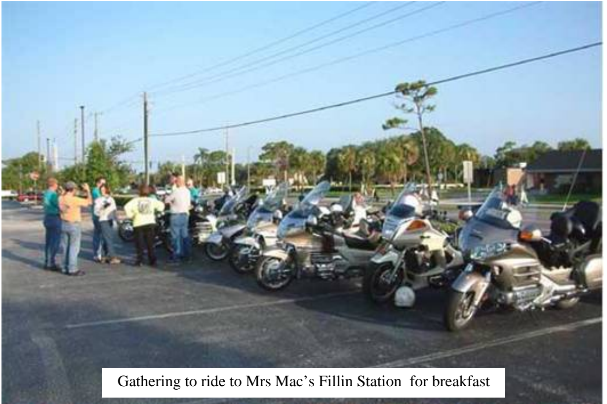
Gathering to ride to Mrs Mac's Fillin Station for breakfast