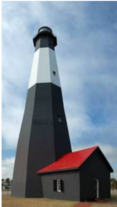
Fig 6 - Tybee Is. Light House

The sixth fort, Fort Screven (Fig 5), is a couple of miles up the road on Tybee Island. This fort was modernized during WW-II and is now made of steel re-enforced concrete. The Tybee Island Light House (Fig 6) is across the street. I had visited both of these on my previous trip so I made a slow pass and continued back to the other forts and then on to Savannah.